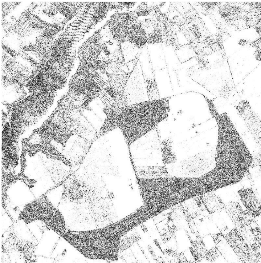
Figure 4: Probability of obtaining smaller value of -2\rho \ln Q , i.e., change probability, full polarization.