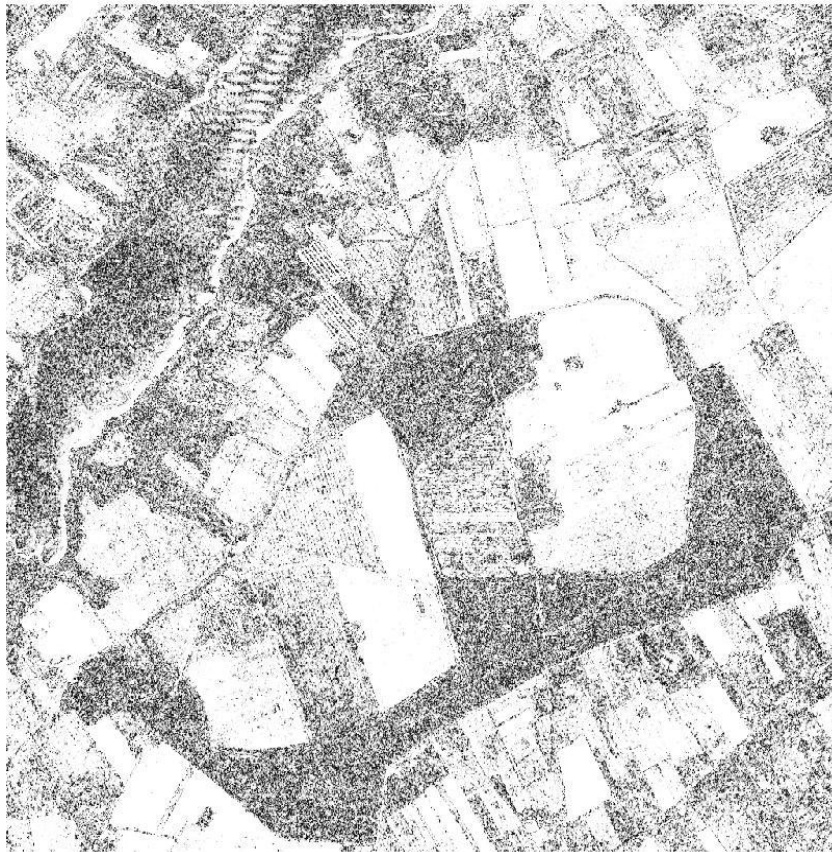
Figure 6: Probability of obtaining smaller value of -2\rho \ln Q , i.e., change probability, dual polarization, HH and HV.