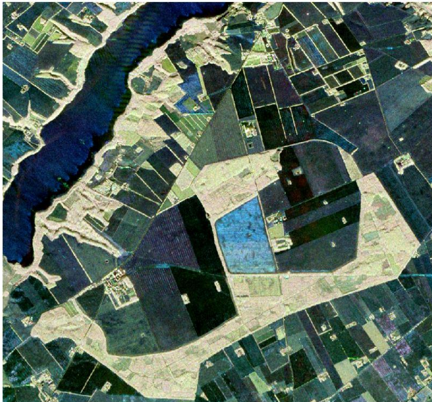
Figure 1: L-band RGB image (R is HV, G is HH and B is VV), 17 April 1998; 5,120 m by 5,120 m.

In (1) we introduced a new test statistic for equality of two variance-covariance matrices following the complex Wishart distribution with an associated probability of observing a smaller value of the test statistic. We also demonstrated its use for change detection in both fully polarimetric and azimuthal symmetric synthetic aperture radar (SAR) data (2). An appendix in (1) gave details and mentioned the possibility of application of the test statistic and the associated probability to block-