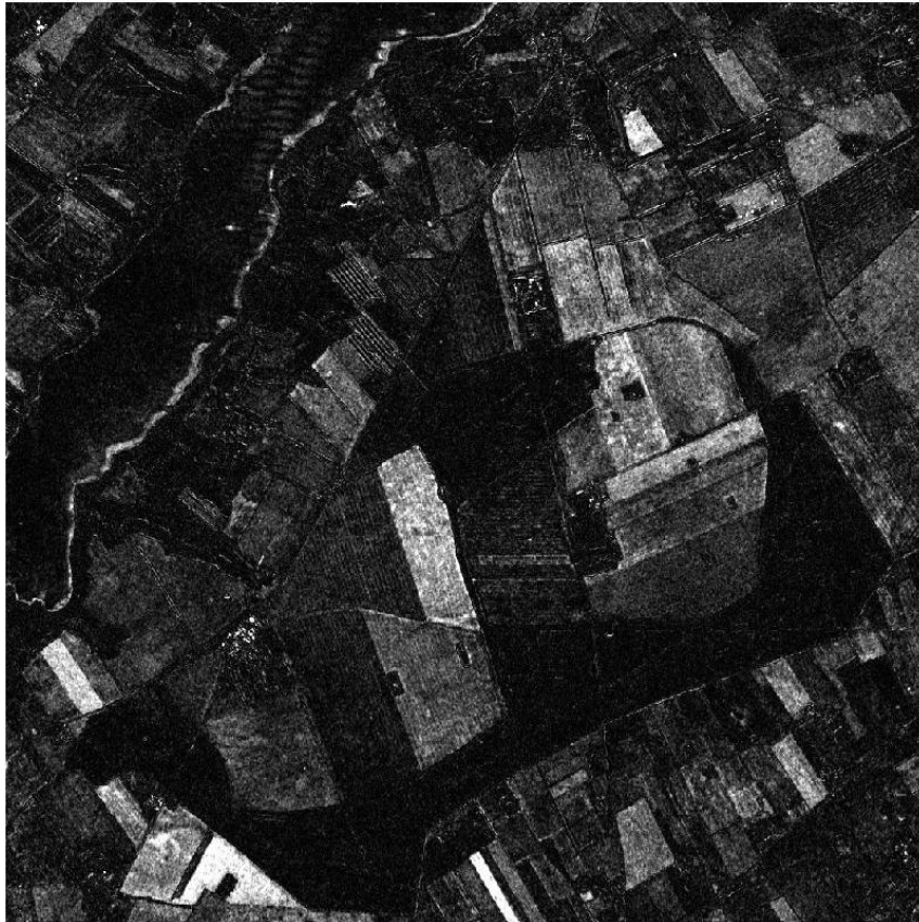
Figure 5: -2\rho \ln Q , dual polarization, HH and HV.

wishart_change tests for equality of two complex variance-covariance matrices in the following cases