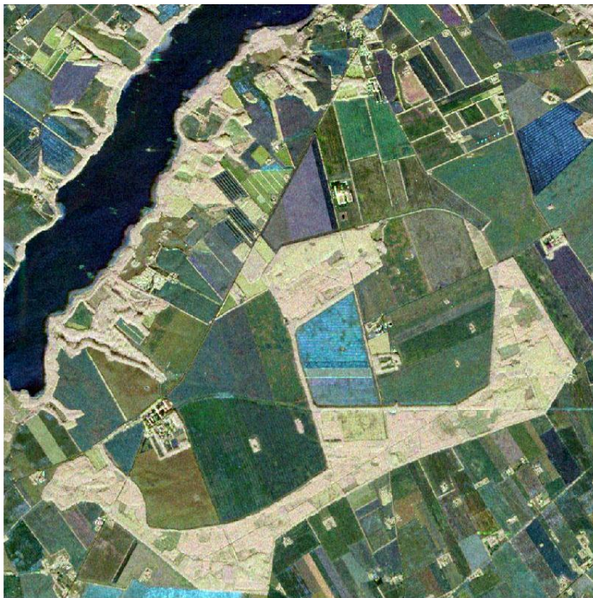
Figure 2: L-band RGB image ( R is HV , G is HH and B is VV ), 16 August 1998; 5,120 m by 5,120 m.

In the covariance representation of multi-look polarimetric SAR data, a test statistic for equality of two matrices X and Y following the complex Wishart distribution is