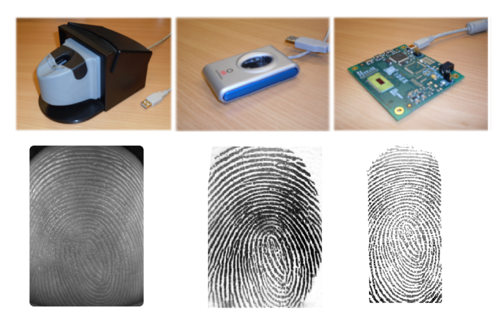
Fig. 1. Left: touchless optical sensor (TST BiRD3), Middle: optical sensor (DP U.4000), Right: capacative line sensor (IDEX SmartFinger<sup>®</sup> IX 10-4) and a fingerprint image from each database, at the same scale factor.

In this experiment, 40 subjects participated and walking were recorded. The gender distribution was the same as with the fingerprint experiment. Subjects were told to walk normally for a distance of about 20 meters in a hall on flat ground. At the end of the hall the subjects had to wait 2 seconds, turn around, wait, and then walk back. A so called Motion Recording 100 (MR100) sensor was used to record the motion. The MR100 measures acceleration in three orthogonal directions, namely up-down, forward-backward and sideways