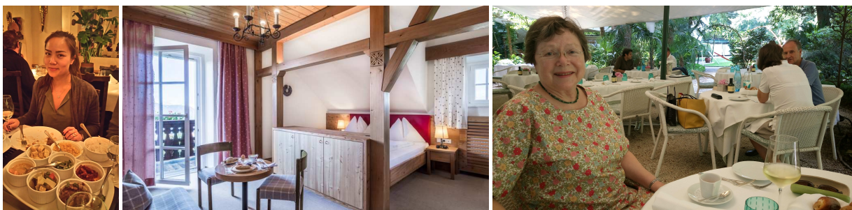
(1) Camilla: Rijstafel, Amsterdam. (2) Room 202 at Latemar. (3) Hotel Laurin Garden Rest., Bolzano.