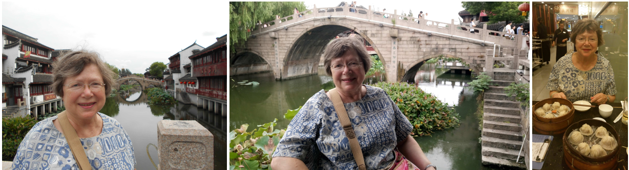
(1-2) Qi Bao, a water town within Shanghai. (3) Shanghai NanXiang Steamed Bun, Old Town.