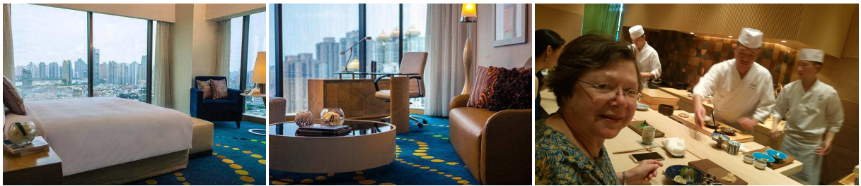
(1-2) Our 19th floor Club Lounge suite in Shanghai. (3) The Sushi Ginza Onodera , The Bund, Shanghai.