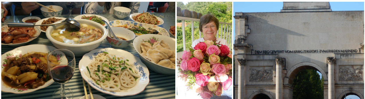
(1) Lunch at WeiWei's mother. (2) Guess Who!? (3) The Münchener Siegessäule.

The Victory Arch inscription reads: DEDICATED TO VICTORY. DESTROYED BY WAR. URGING PEACE.