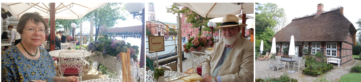
(1–2) Italian lunch on The Red Square. (3) The Herzog retreat !