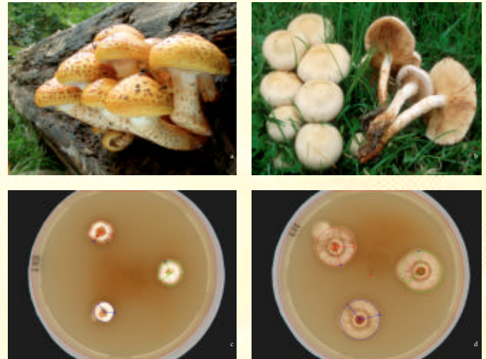
Fig. 1a-1d. Pholiota aurivella (left column) and Ph. gummosa (right column) as they appear in nature (upper row) and when grown on ALK medium (bottom row). Figs. 1c and 1d show the results after digitization, region extraction, and localization of the colonies. Only the part of the colony that is free of direct influence from neighboring colonies is used in the analysis.