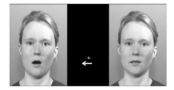
Fig. 1. A sample frame from a bilateral stimulus.

To these aims, we designed stimuli so that the influence of the target face, the visual distractor and the voice could be discerned in participants' responses. The critical, bilateral stimulus consisted of a movie of two talking faces dubbed with a synchronized voice. The faces were displaced symmetrically to the sides of a central fixation point and a cueing arrow pointed to the target face. This stimulus configuration is adapted from Posner's studies of endogenous visual spatial attention (Posner, 1980; Posner et al., 1980). The stimulus configuration is depicted in Fig. 1 (see online Supplementary material for a sample video).