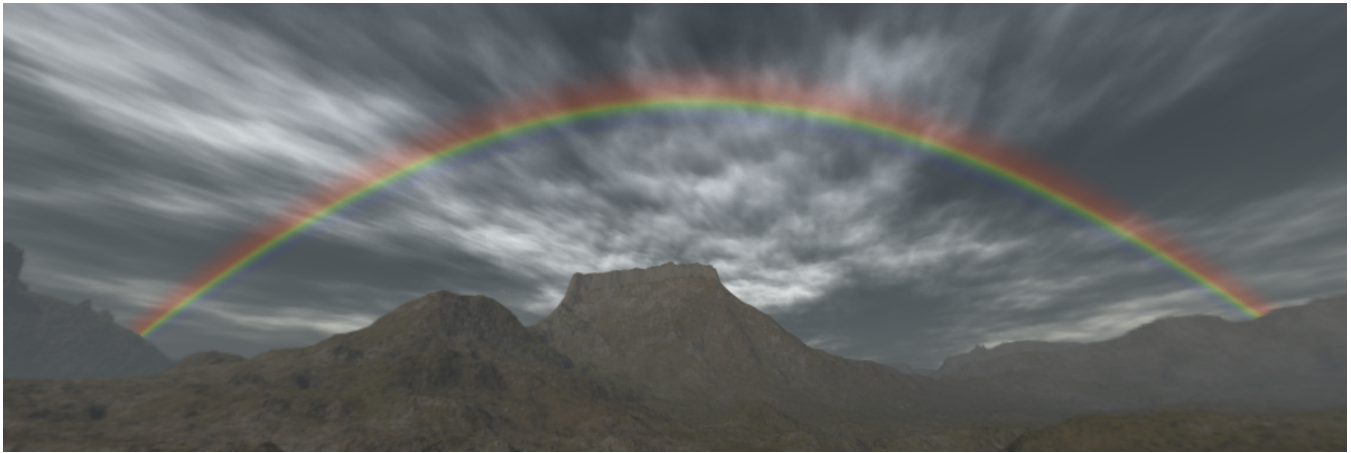
Figure 1: A rainbow rendered in real-time using Aristotle's theory for rainbow formation.