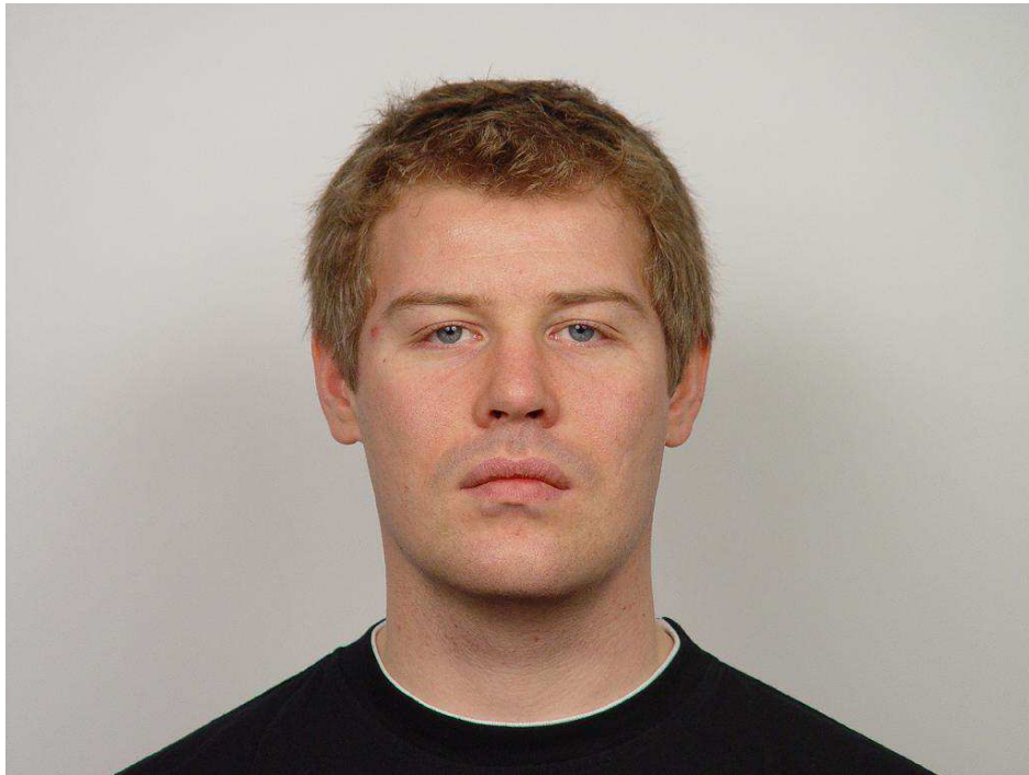
Figure 3: Example of a full size image.